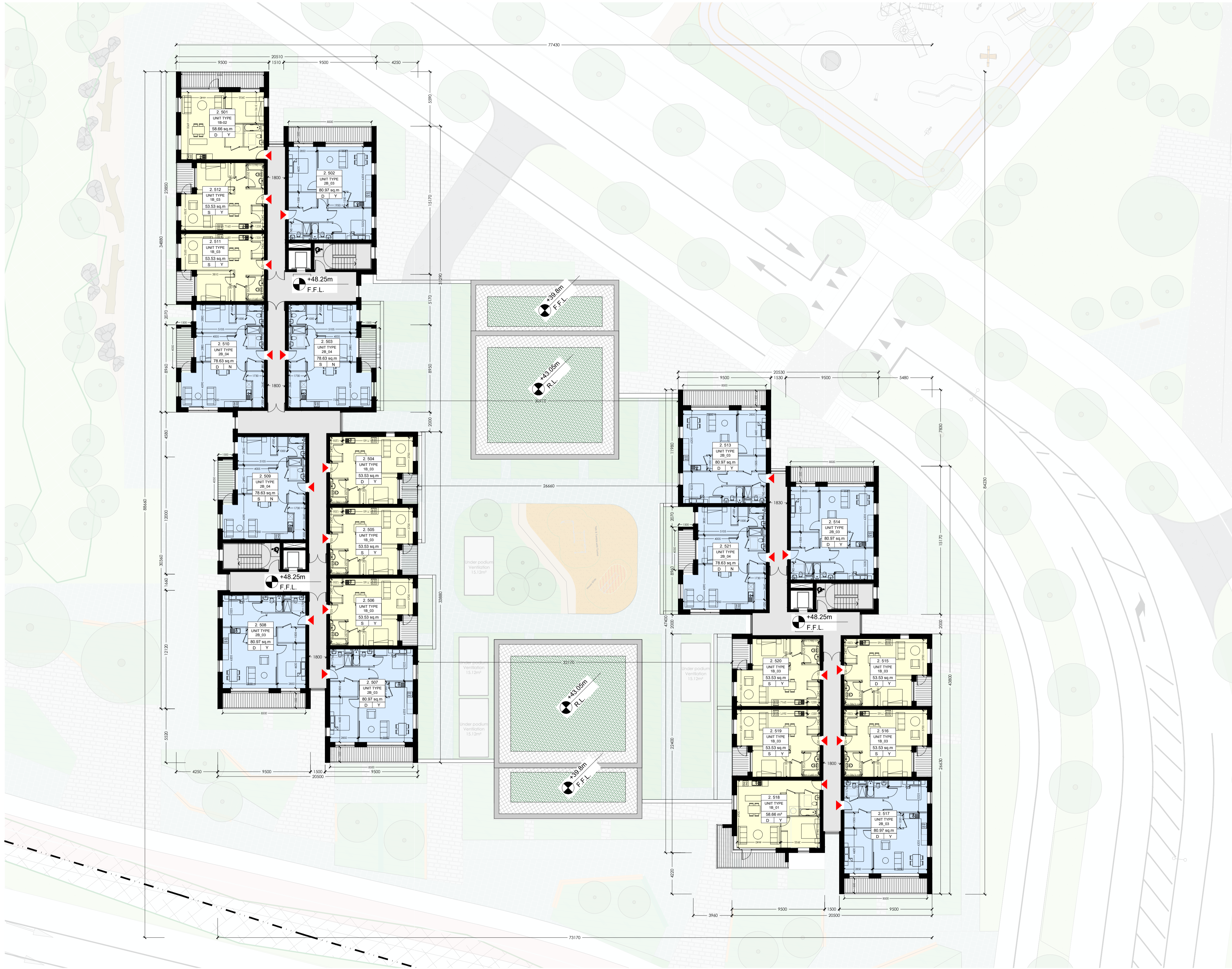
5th Floor Plan - Block 2 Scale 1:200 @A1